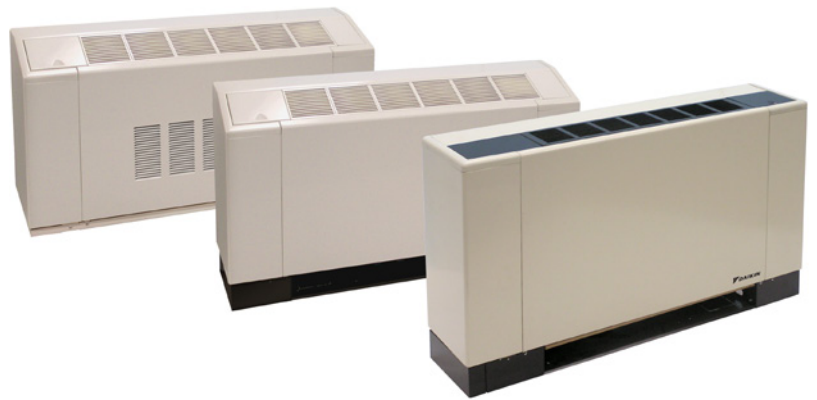
Model WMHC - standard range Model WMHW - extended range

Console in-room slope tops and flat tops